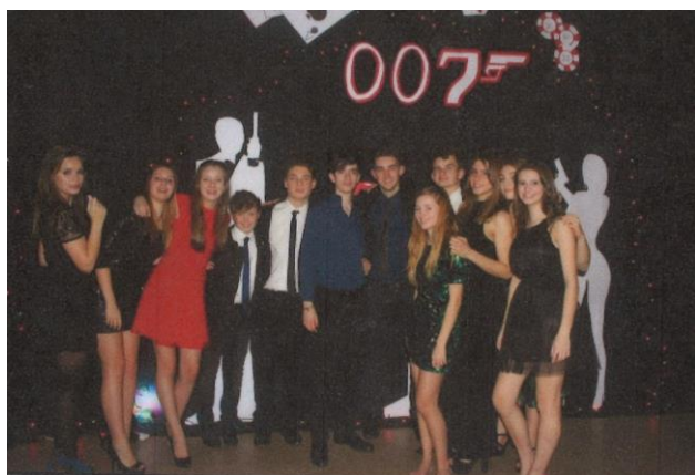
Some guests enjoying the Snow Ball

Ashtead is recognised as comprising the Village to the south and Lower Ashtead to the north. The Village incorporates many of the larger detached houses, the main shopping area either side of the busy A24 and Ashtead Park where St Giles' Church is situated. Lower Ashtead is more densely populated with the majority of houses being semi-detached. The station, common (owned and maintained by the Corporation of London), pond, youth centre and another parade of shops are all situated here together with St George's Church, as well as the Roman Catholic and Baptist Churches. The parish is mainly a middle class, owner-occupied area. There are few starter homes and a former council house area. Due to property prices, it is a difficult area for young adults to rent or buy property. However, Ashtead is a popular place for young families moving out of London. The parish has a strong 'community' feel and sense of identity.