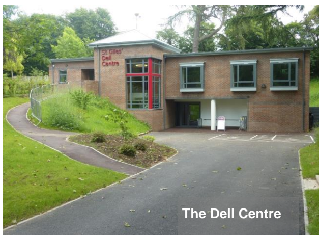
The Dell Centre

Next to St Giles' Church is the Dell Centre. This modern and well equipped centre for ministry complements St. George's.