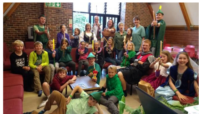
Pathfinder Weekend Away