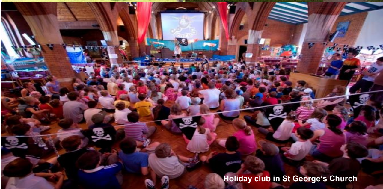
Holiday club in St George's Church

Leader of Children & Families' Ministry Information Pack www.sgsgashted.com