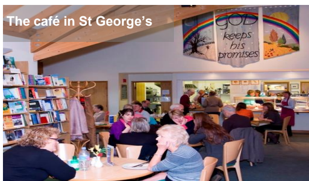
The café in St George's

The church centre is open 7 days a week. Facilities include a café (Mon-Fri), hall, meeting rooms and office space for parish administration.