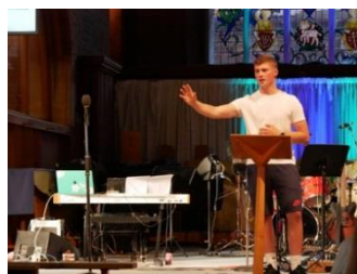
Preaching at The Six