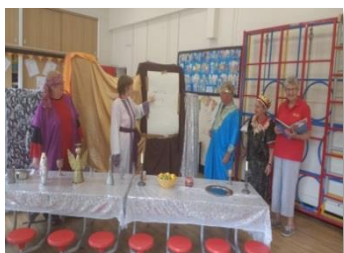
Open the Book Assembly