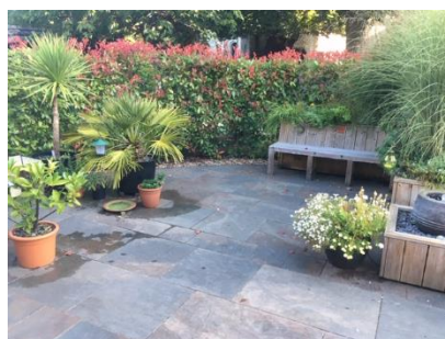
Prayer Garden at the Dell Centre

In the coming year we hope we can increase our planned giving by 10% - that's £52,000